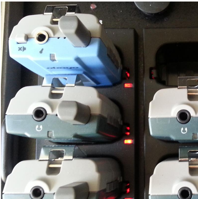
Charging (Lights are solid red)